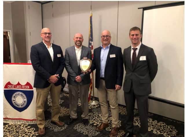
MONTGOMERY & RONALD REAGAN HAM-SR126/US22-20.00/13.19 – CITY OF MONTGOMERY