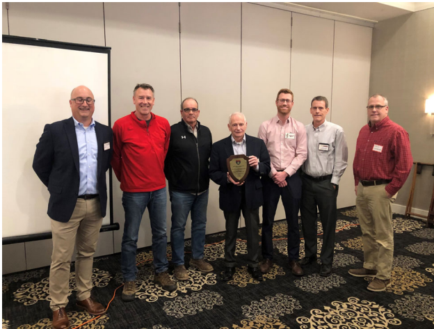
WAYNE MADISON ROAD & HAMILTON TRENTON ROAD – BUTLER COUNTY ENGINEER