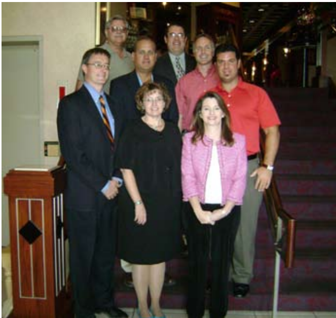
TRIKO Valley 2008-2009 Board of Directors