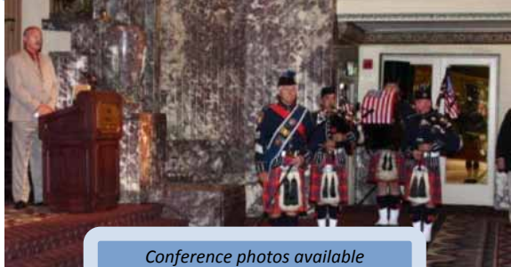
Conference photos available www.ashe2010.org

The ASHE 2010 National Conference had over 533 Conference participants. It was a successful event which was kicked off by the City of Cincinnati and Hamilton County with full regalia to set the stage for Transforming Ideas into Mobility .